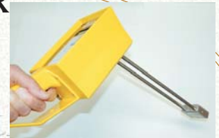
Portable Moisture -- AK30 & AK40GW