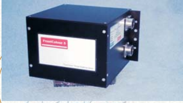
Brightness -- FrontColour 5 Brightness