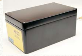
Moisture -- AK50, AK40 and AK40GW