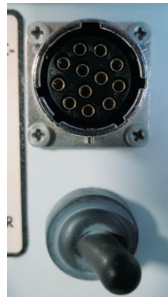
Figure 2. Power switch and power supply connector for AK40, a 12-pin ITT Cannon