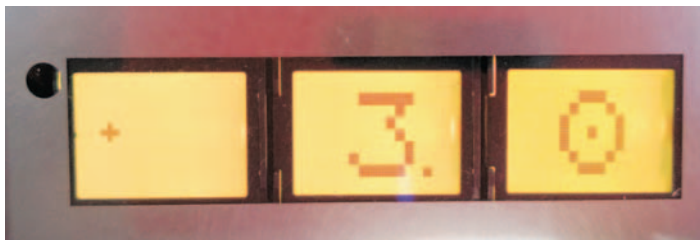
Figure 6. AK30/MK30 display with big numbers in yellowish colour in TABLES mode

The calibration table is changed by first pressing the Bank select button to make the displays yellowish in colour ( Tables mode ), instead of the bluish colour in the Banks mode and back again with the same key. The change is also indicated with a text label on the central display ( TABLE/BANK ). To switch to any of the available tables, press either the arrows UP/DOWN one table at a time or keys 4/1 for changing 10 tables at a time. The table number reached is flashed shortly in big numbers. You can immediately start measuring with that table. The table number can also be selected within the menu system ( 3=Tables ). The name of the table will be shown in the center display, bottom line, once selected.