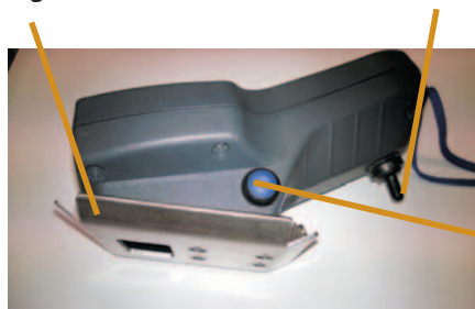
Figure 3. Power switch for AK30 and the PUS