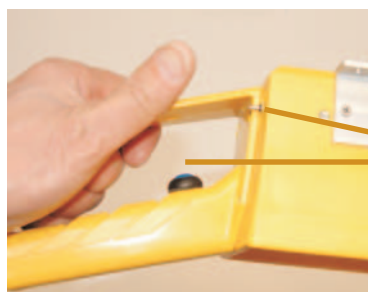
Figure 5. Power switch and the additional Autotimer start/stop switch for MK30R/ AK40GW models