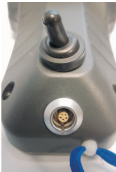
Figure 1. Power switch and charger connector for AK30, a LEMO OK connector