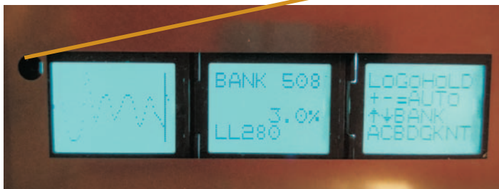
Figure 7. AK30/MK30R display with the trend curve and detailed information, in blueish colour in BANKS mode. The menu system is available at the same time.

A hole for Bluetooth active link red light indicator